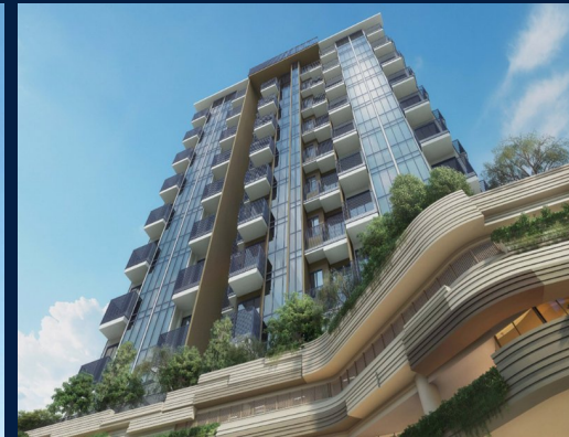
1 - Bedroom + Study